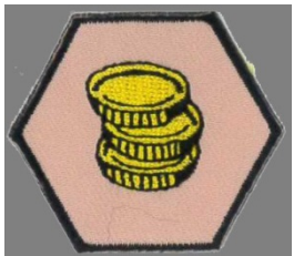
St. Vincent de Paul, patron saint of charity Symbol: three coins