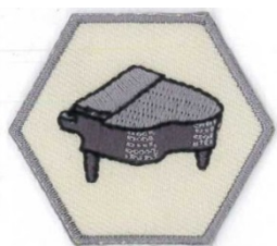
St. Cecelia, patron saint of music Symbol: piano