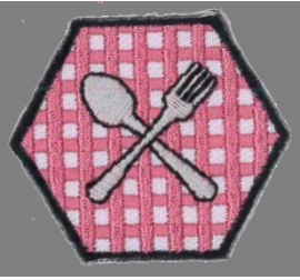
St. Martha, patron saint of cooks Symbol: spoon crossed with a fork