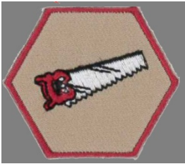
St. Joseph, patron saint of woodworkers Symbol: carpenter's saw